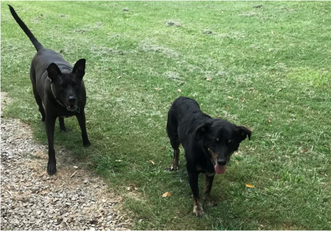
MISSY & BOY