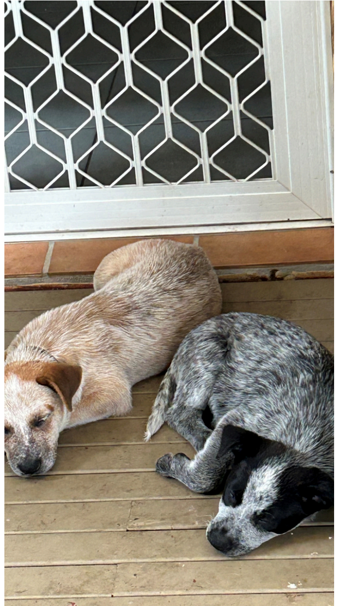
BUD & KATIE